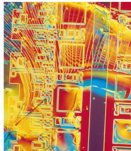
An early stored-program computer (left), built around 1950, used vacuum tubes in logic circuits, whereas modern computers use transistors and silicon wafers (right), but both are based on the same principles.

that a cell receives from its environment can influence which genes it expresses — and thus which proteins it contains at any given time — or even the rate of mutation of its DNA 13 , which could lead to changes in the molecular structures of the proteins. This is in contrast to physical systems where, typically, macroscopic perturbations or higher-level structures do not modify the structure of the molecular components. For example, the existence of vortices in a fluid, although determined by the dynamics of molecules, does not usually change the nature of the constituents and their molecular interactions.